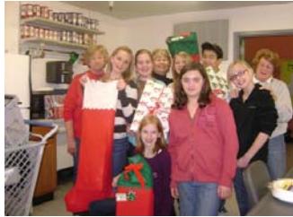
Beta Delta with the SCA at Hidden Valley Middle School Shopping for a needy family.