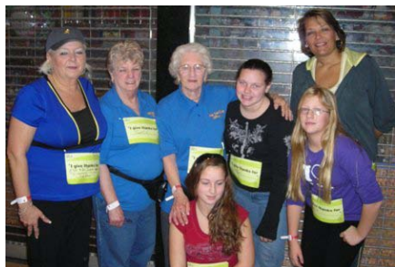
Beta Tau's 5K Walk Team at Potomac Mills November 11, 2009

We are looking forward to participating in the Radiothon to benefit St. Jude Children's Research Hospital on Feb. 11 in Rockville, Maryland. In addition, we are going to have a party on Feb. 20 th to celebrate Beta Tau's 40 th Anniversary as a Chapter of ESA. Looking forward to seeing you in March at the Spring VSC meeting.