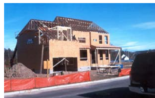
St. Jude's Dream Home