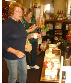
Holiday Open House at the Fishburn Mansion