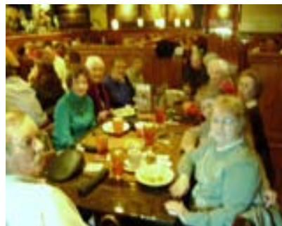
Beta Tau at Elvis' 75 th Birthday Party to benefit the Children's Miracle Network