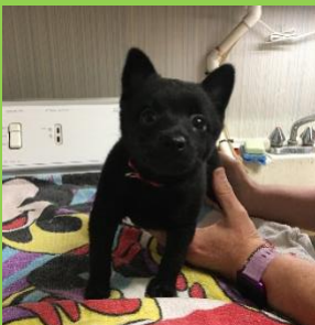
Kaya at 8 weeks, and with the "Big" dogs.