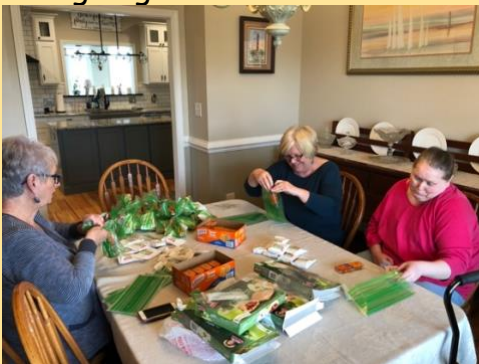
Filling bags with St. Patrick's day treats!