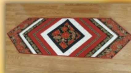
Table Runner Raffle - to benefit - St Jude Children's Research Hospital Raffle Drawing on May 22, 2022 $1 each OR $5 for 6 chances