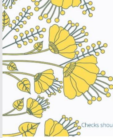
Table Runner Raffle to benefit St Jude Children's Research Hospital

Raffle ticket- $1 each OR $5 for 6 chances